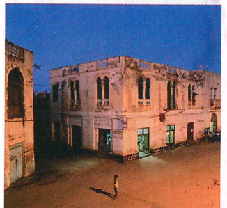
Eritrea Peace gives the North Korea of Africa a chance to open up: leader, page 8. A repressive dictatorship ponders reform, page 36